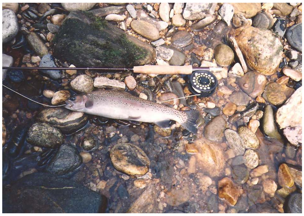
CATCH-AND-RELEASE! Ray photographed and return to the fish.